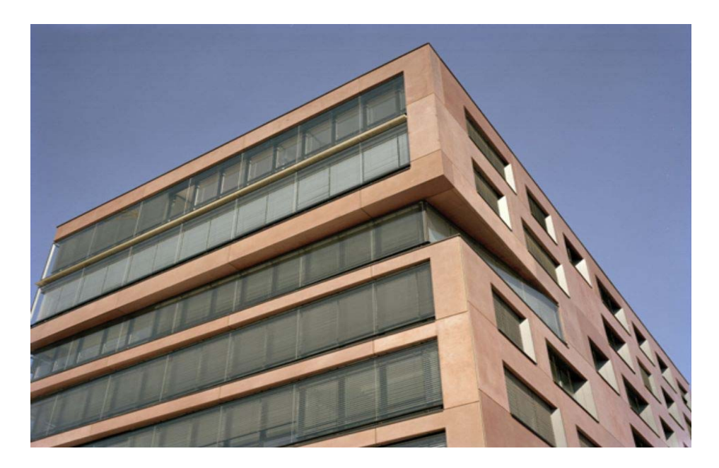
Façade of the House on Sandtor quay: Red colored_precast concrete cladding panels